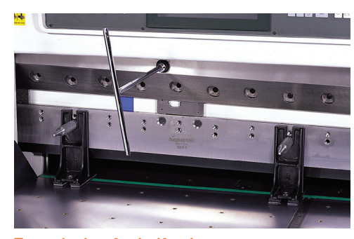
Easy design for knife changes

The mechanical knife removal system is designed for efficiency and ease of use. One operator can safely replace the blade in ten minutes.