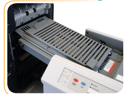
Enclosed paper path provides optimal document security

The FD 2002IL processes forms securely in a compact and powerful design. The user-friendly control panel features LED indicators and a six-digit resettable counter. The FD 2002IL is built in the USA with proven Formax strength and reliability.