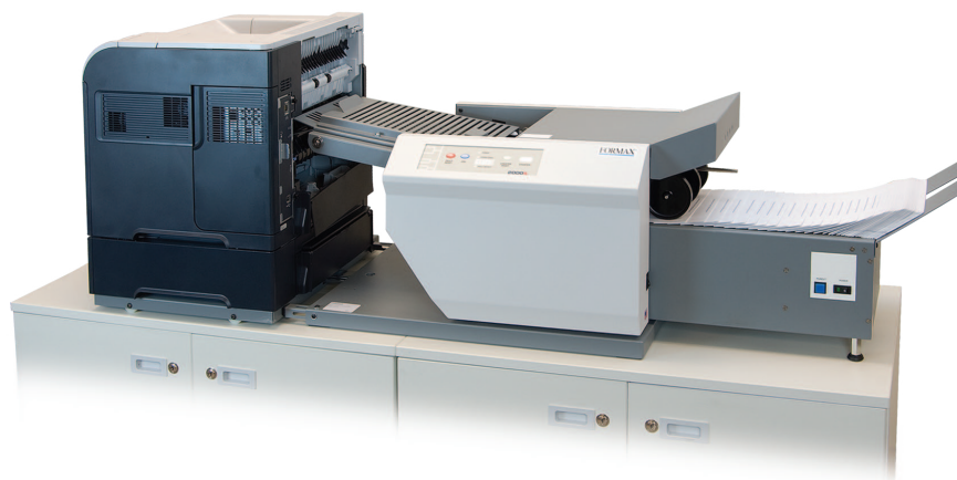
FD 2002IL System shown with IL Pressure Sealer and Alignment Base, laser printer (not included), and optional locking cabinets and 18" conveyor