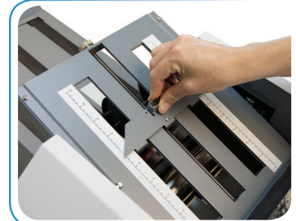
Pre-marked adjustable fold plates