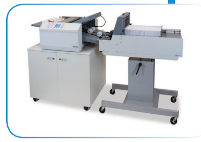
FD 2054 in-line with optional V-Stack36 Vertical Stacker, stand and cabinet