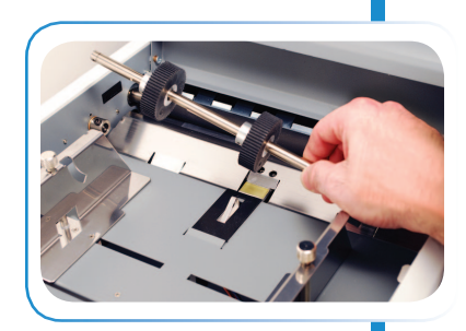
Removable Feed Wheels