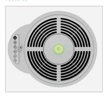
HIGH QUALITY CONTROL

EASY-Touch control is intuitive and convenient. Functions: on / off, auto, level 1/2/3, turbo, and night mode.