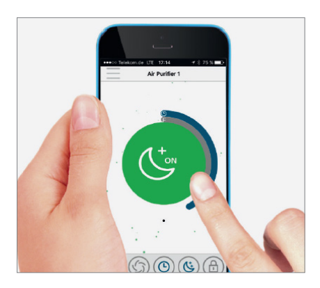
IDEAL AIR PRO APP

The current air quality is indicated in a three color code via LED in the EASY-Touch panel.