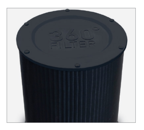
360° MULTI LAYER FILTER

Enables further control and customization of your device. Available at Google Play & Apple App Store.