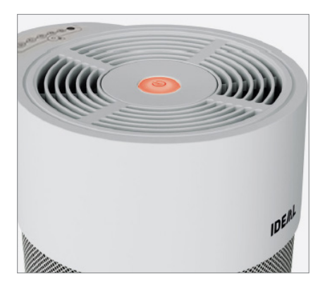
COLOR CODES INDICATE AIR QUALITY

EASY-Touch control is intuitive and convenient. Functions: on / off, auto, level 1/2/3, turbo, and night mode.