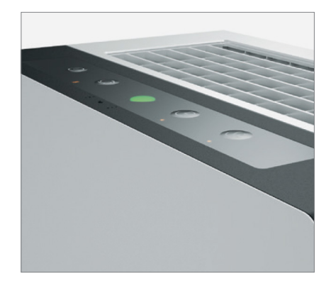
USER-FRIENDLY CONTROL PANEL Control in an intuitive and comfortable way. Functions: on / off, auto /manual / turbo, timer, night mode.