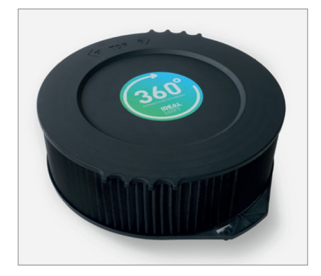
360° MULTI LAYER FILTER

Monitors the air quality with a fine dust sensor, gas and odor sensor - for perfect indoor air in auto mode.