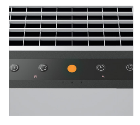
COLOR CODES INDICATE AIR QUALITY The current quality of the indoor air is indicated by color-coded 3-level RGB LED. It is also suitable as a night light.