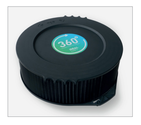
360° MULTI LAYER FILTER The high performing 360° filter consists of a fine mesh prefilter, true HEPA filter, and Active Carbon filter. Equipped with RFID intelligence for a comfortable filter change.