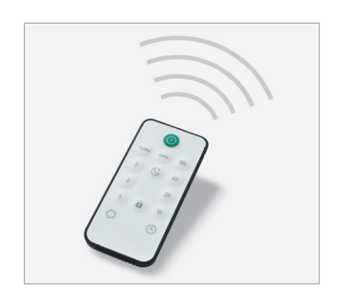
REMOTE CONTROL The AP80 PRO can also be controlled easily via remote control. It is magnetic – for practical storage.