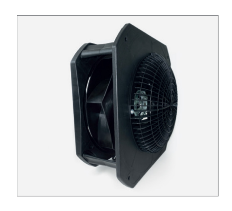
COMPACT POWER PACKAGE The integrated GreenTech EC motor provides up to 50% lower energy consumption compared with AC solutions and, in addition, is ultra silent. It makes the AP80 PRO one of the quietest and powerful air cleaners in the market – Made in Germany.