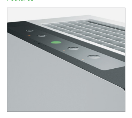
USER-FRIENDLY CONTROL PANEL Control in an intuitive and comfortable way. Functions: on / off, auto /manual / turbo, timer, night mode.