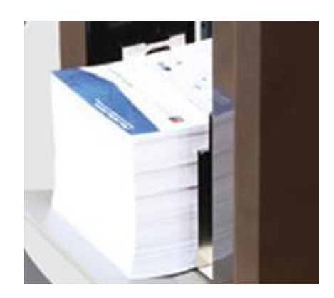
LARGE INFEED CAPACITY The easy-to-load, auto-lift infeed hopper holds up to 1,400 sheets for time saving throughout processing.