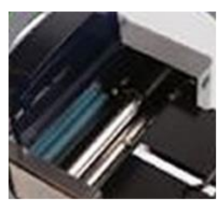
HEAVY-DUTY CYCLE Quality-engineered parts allow the MX17000 to process up to 500,000 sheets per month.