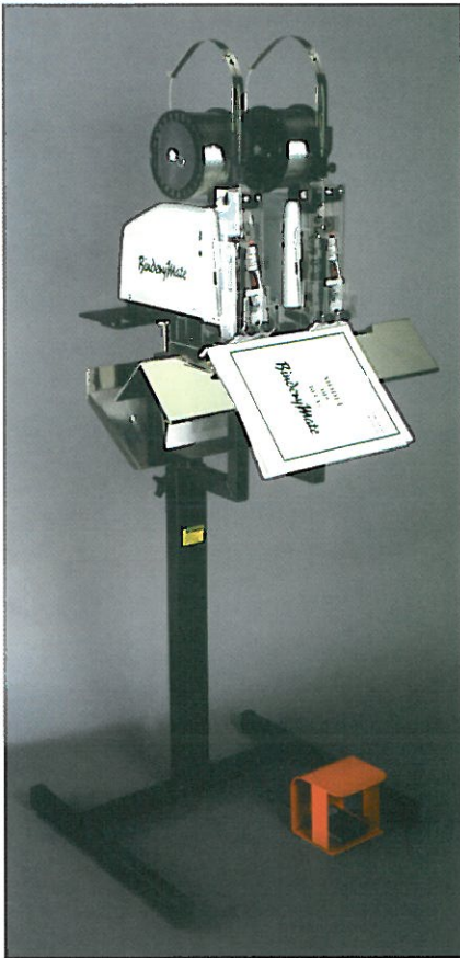
ORIGINAL STAND ADJUSTS FROM 29" TO 41" IN HEIGHT