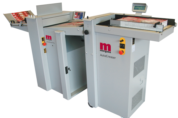
Picture shows AutoFold Pro with Morgana AutoCreaser

The beauty of the AutoFold Pro is its simplicity allowing the user of ANY manufacturer's creaser to invest in one and to improve their productivity and quality immediately.